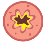
ASTHMATIC AIRWAY DURING ATTACK