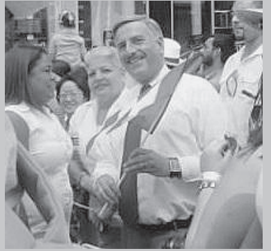
Assemblyman Weprin marches at the 56th Annual National Puerto Rican Day Parade.

Assemblyman Weprin Celebrates Puerto Rican Heritage