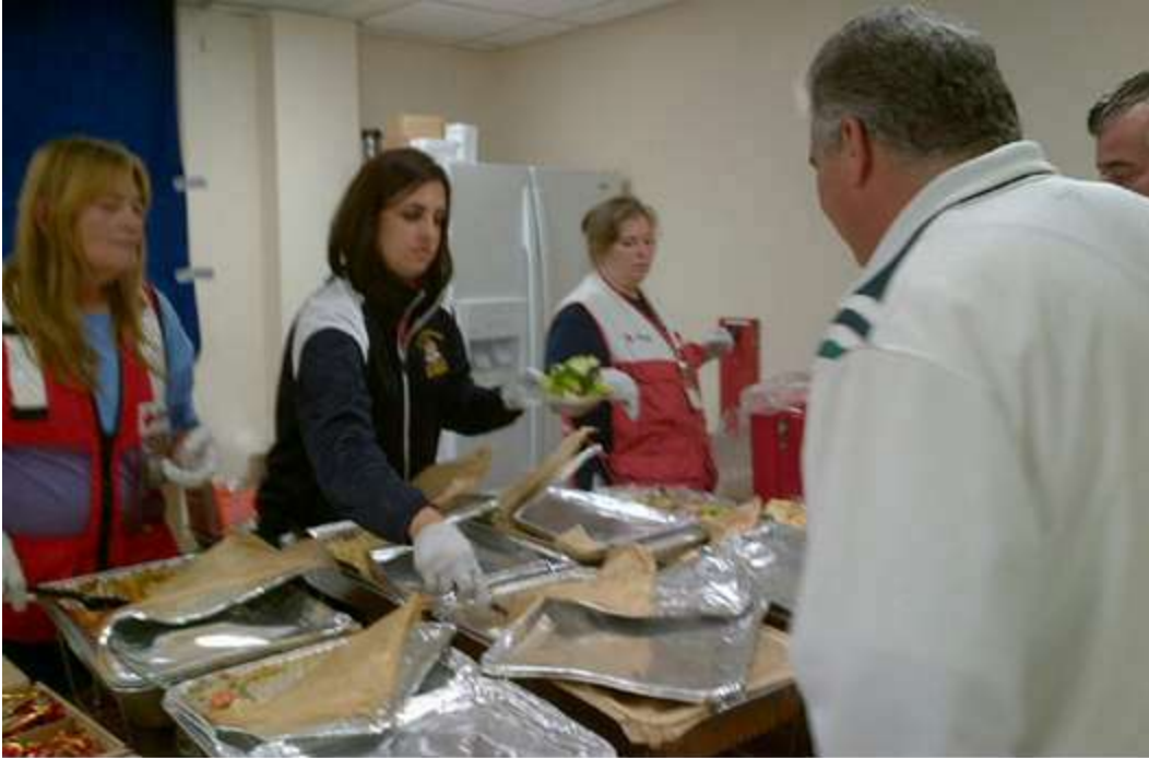
Assemblywoman Malliotakis serves food at a shelter for residents displaced by Superstorm Sandy.

Assemblywoman Nicole Malliotakis (R,C-Brooklyn, Staten Island) is promoting a resource guide compiled by the Staten Island Advance as a valuable tool for Staten Islanders seeking assistance in the wake of Superstorm Sandy. The guide connects residents to: