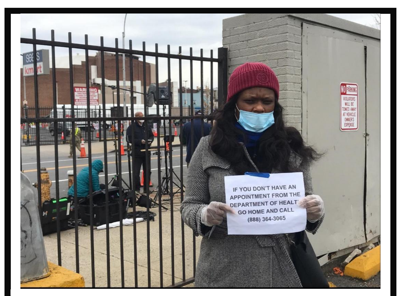
Assemblymember Rodneyse Bichotte visiting the COVID-19 testing site at Sears parking lot, holding up a sign informing people to call for an appointment before arriving