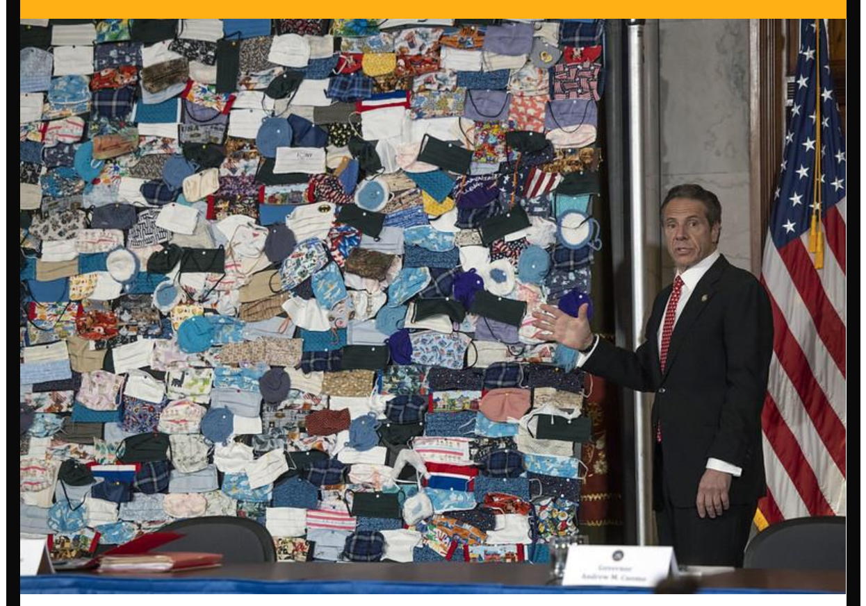
"Self portrait of America" mural of homemade masks sent to New York from people across U.S.