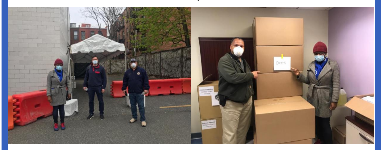
Assemblymember Rodneyse Bichotte at the COVID-19 walk-in testing site in Flatbush. Assemblymember Bichotte partnered with Governor Cuomo's office, One Brooklyn And Morris Heights Health Center to open this site