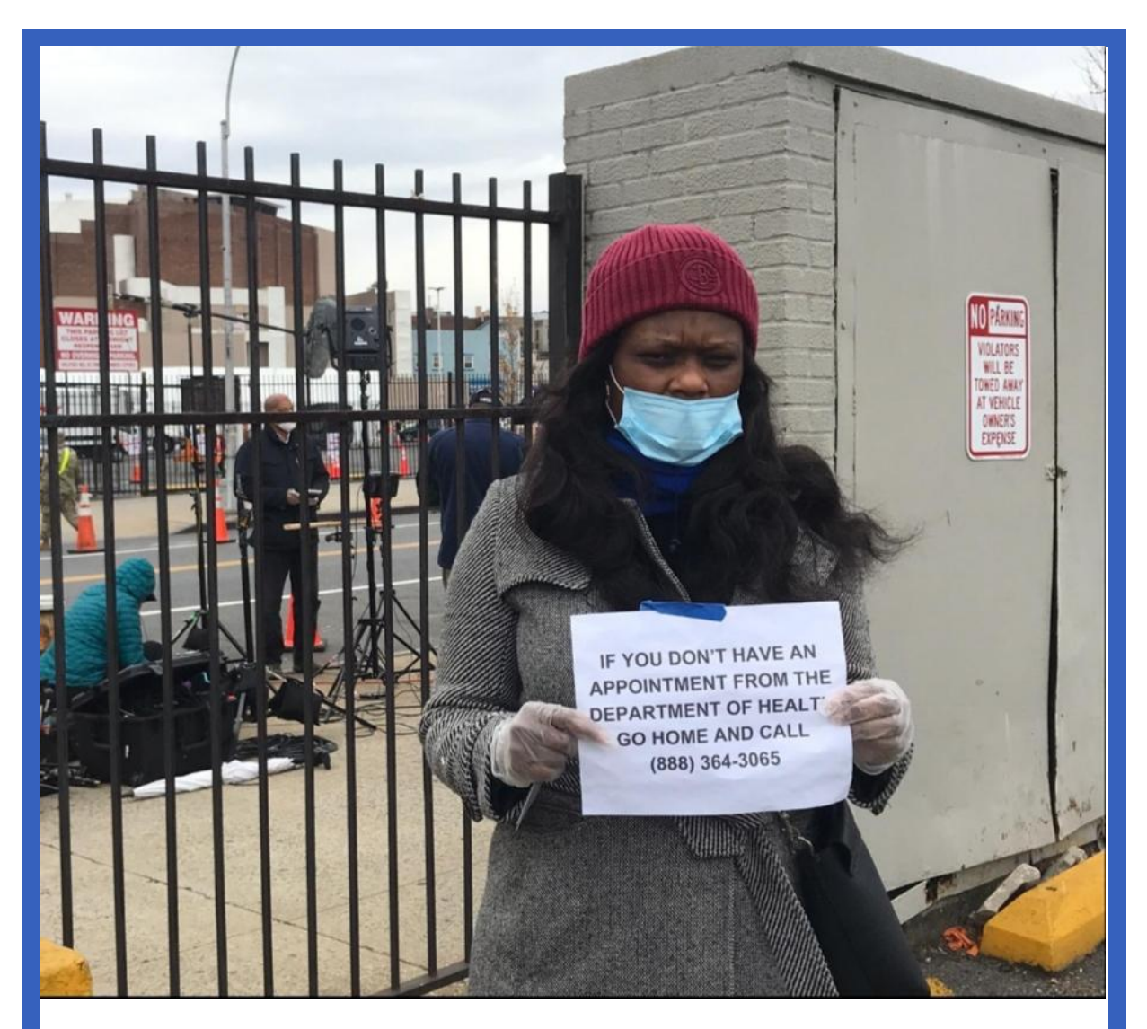
Assemblymember Rodneyse Bichotte visiting the COVID-19 testing site at Sears parking lot, holding up a sign informing people to call for an appointment before arriving

Assemblymember Rodneyse Bichotte represents the 42nd Assembly District in Brooklyn covering Ditmas Park, Flatbush, East Flatbush and Midwood. She is currently the Chair of the Subcommittee on Oversight of Minority and Women-Owned Business Enterprises (MWBEs) , and serves on the following committees: Housing, Government Operations, Education , Banks, Health, and Higher Education . She is also a member of the Task Force on Women's Issues and sits on Governor Cuomo's Domestic Violence Advisory Council and Mayor De Blasio's MWBE Task Force.