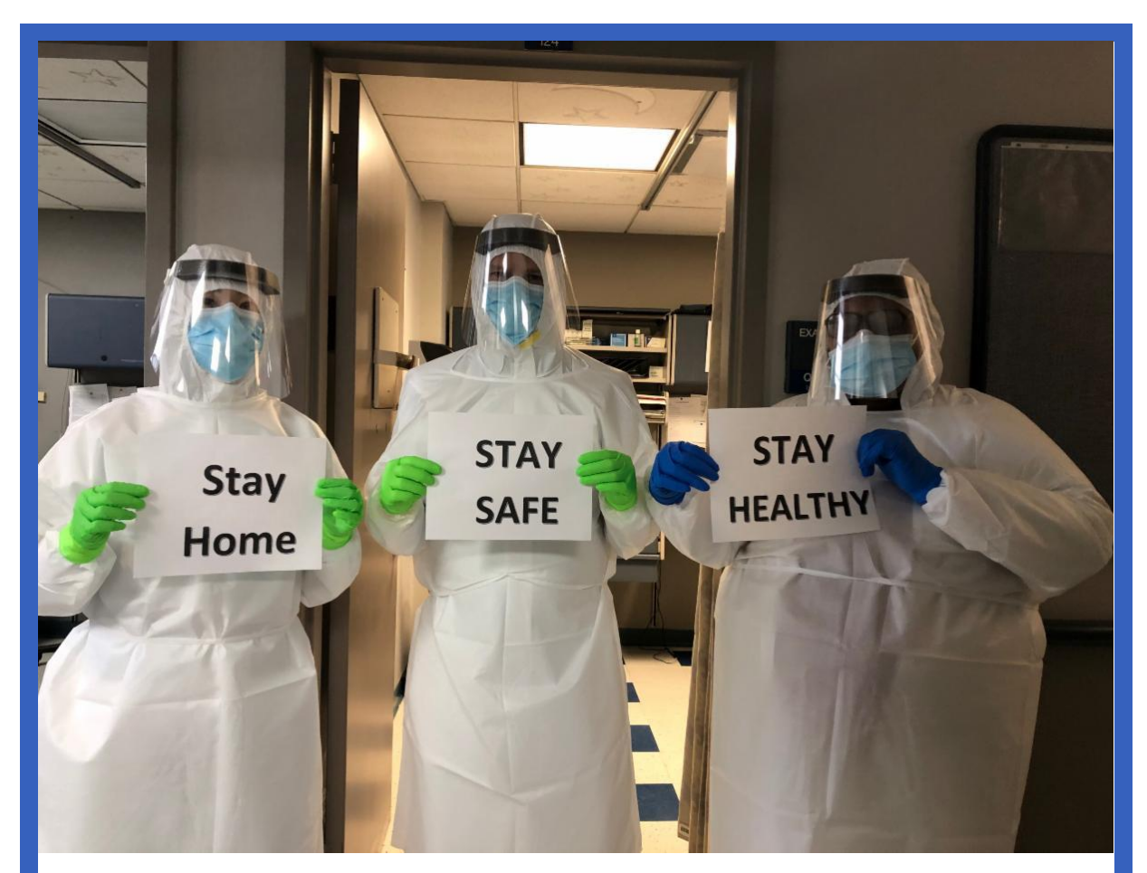
Healthcare workers at the new Flatbush walk-in site holding signs that say "Stay home, stay safe, stay healthy"