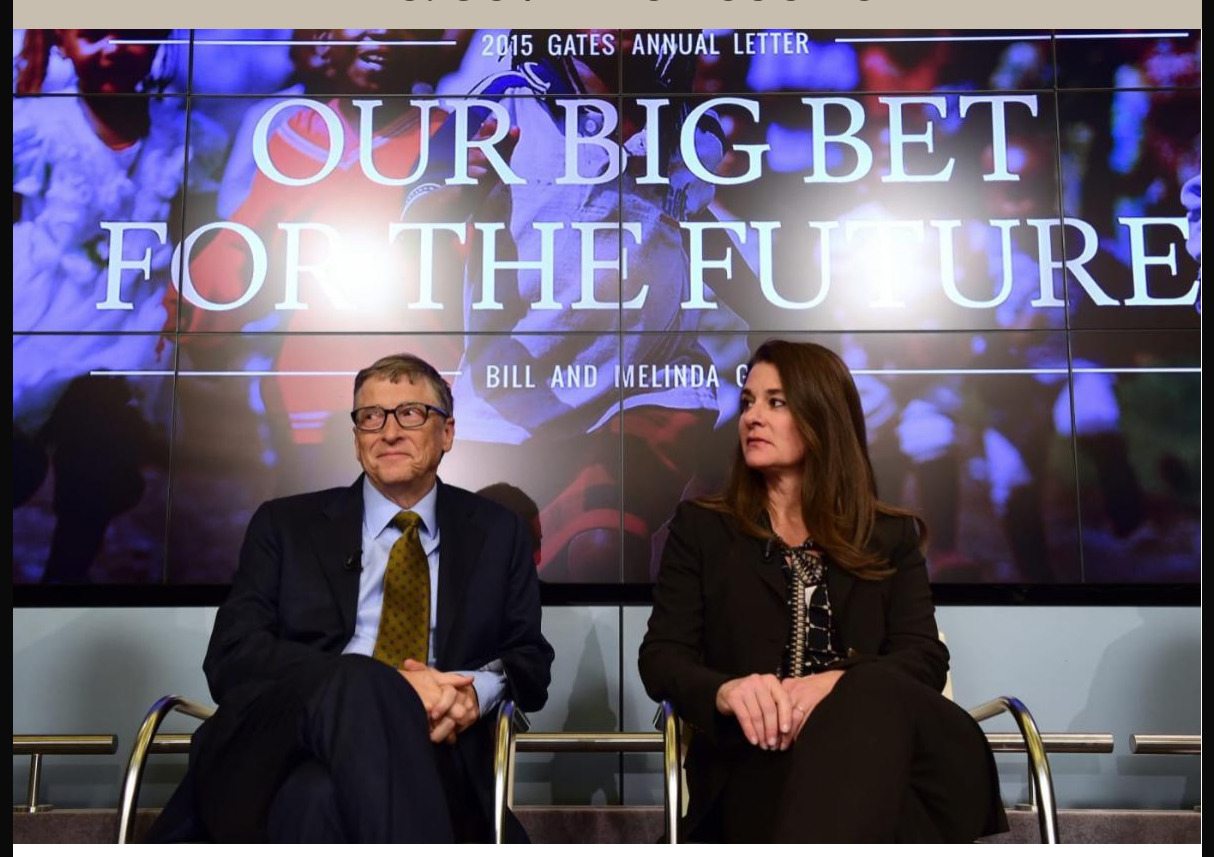
Bill and Melinda Gates