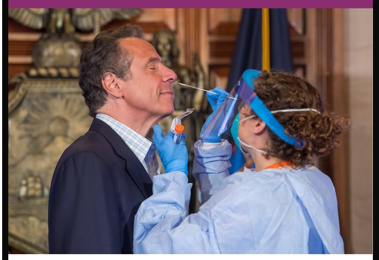
Photo Credit: Governor Cuomo; Governor taking a COVID-19 test today during his briefing.

Capital Region and Western New York is close to reopening. Testing and tracing capacity has to be finalized for regions.