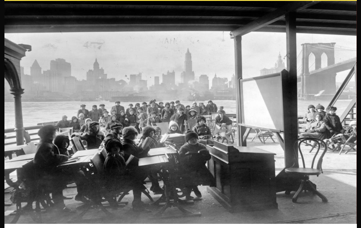
Photo Credit: Bureau of Charities, via Library of Congress. A classroom on a ferry in NYC circa 1915.