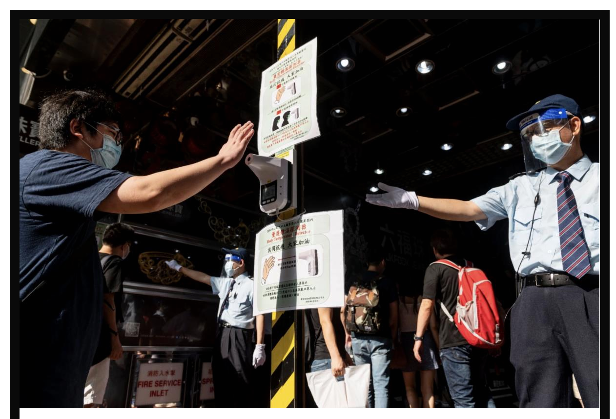
Shoppers go through temperature checks before entering a mall in Hong Kong.