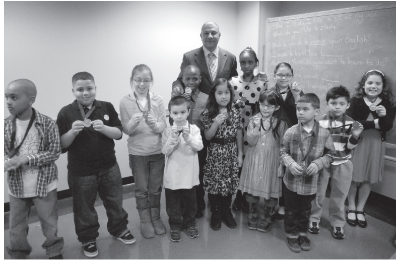
Assemblyman Ramos with the participants of the 2012 Summer Reading Challenge program.

This program helps combat the inevitable decrease in learning—known as the “summer slide”—that takes place when young people are not in school during the summer. It is also a fun, inexpensive, and educational activity that can also provide quality family time and foster a life-long love of reading.