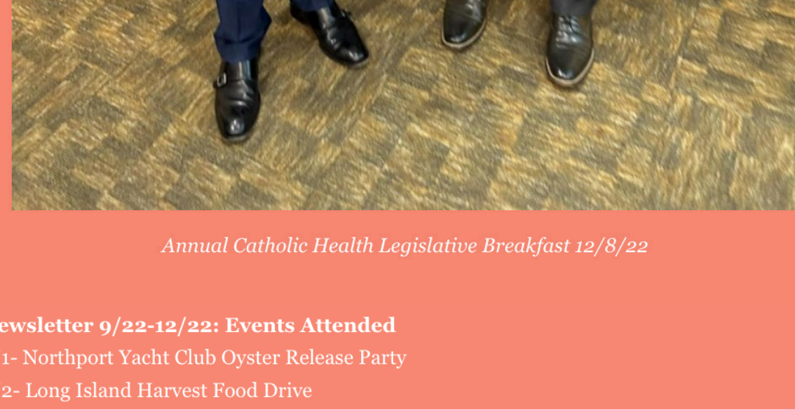
Annual Catholic Health Legislative Breakfast 12/8/22