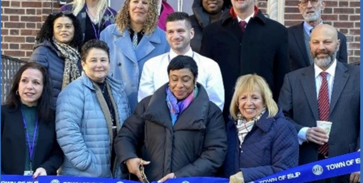
U.S. Marine Corps Toys for Tots Kickoff Press Conference 12/1/22