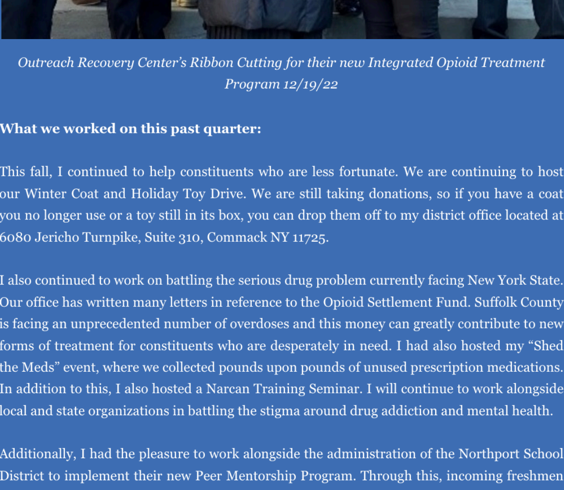
Outreach Recovery Center's Ribbon Cutting for their new Integrated Opioid Treatment Program 12/19/22