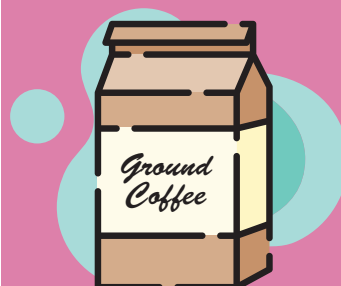
GROUND COFFEE BEANS