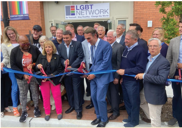
Assemblymember Lavine attends the historic ribbon-cutting and dedication for the brand-new LGBT Network affordable senior housing and community center in Bay Shore. The complex is the first of its kind in suburban America. The 75-unit and 8,000 square foot complex is located at 34 Park Avenue in Bay Shore.