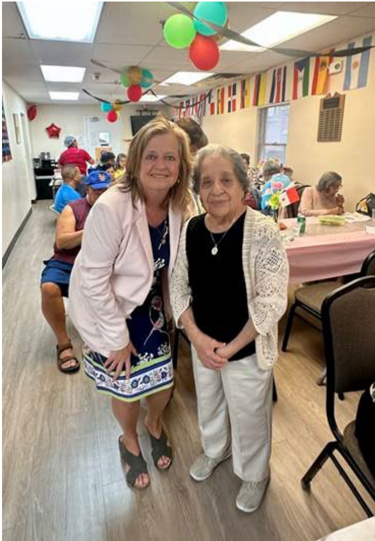
Herald Senior Health and Beyond Expo