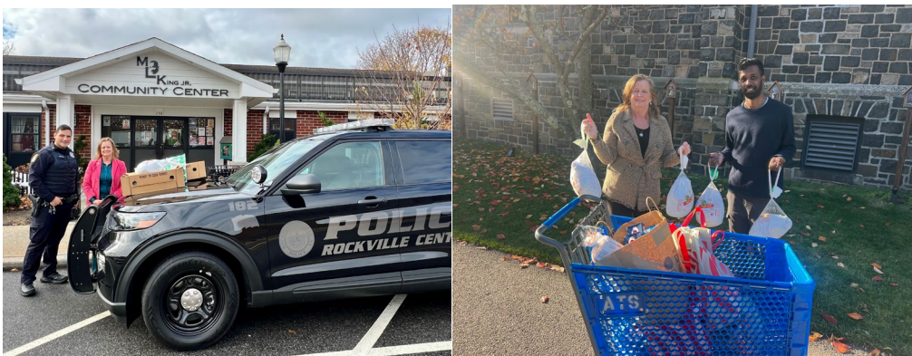
MLK Center's Thanksgiving Celebration