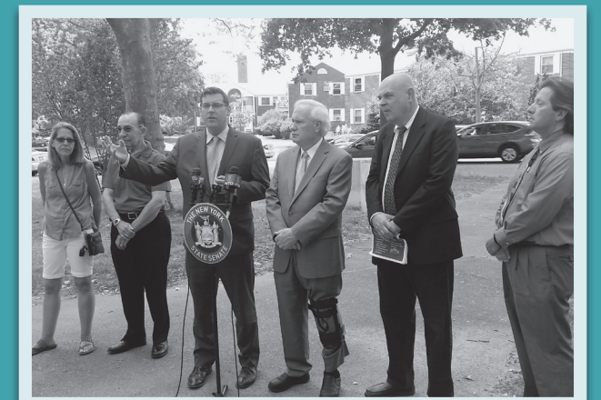
On June 27, 2016, Assemblyman Braunstein and Senator Tony Avella held a press conference announcing the passage of their J-51 tax abatement expansion legislation, helping middle-class co-op and condo owners afford the cost of capital improvements.