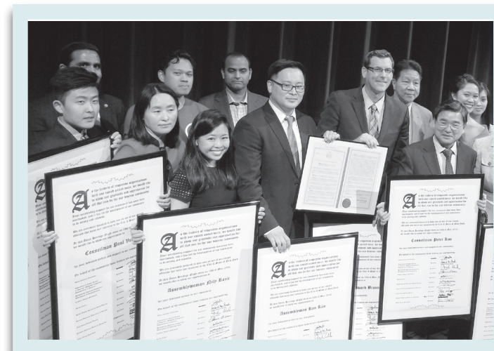
Assemblyman Braunstein attended "Asian Heritage Night in Queens" at Flushing Town Hall.

"Unfortunately, those who serve in government sometimes forget what public service is all about and help themselves instead of their constituents," said Assemblyman Braunstein. "Politicians aren't above the law, and this legislation makes clear that there are serious consequences when they commit a crime. If you defraud the people, we'll defund your pension."