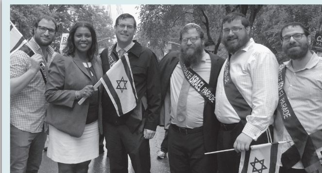
Assemblyman Braunstein marched in the 52nd Annual Celebrate Israel Parade in Manhattan.