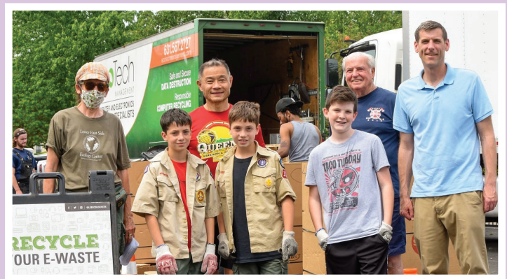
Assemblyman Braunstein partnered with the Lower East Side Ecology Center and Senator John Liu on a successful e-waste recycling event at St. Anastasia in Little Neck, where residents safely disposed of their unwanted or broken electronics for free.