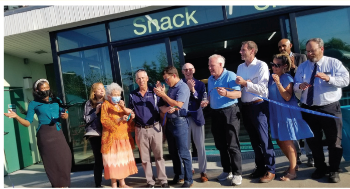
Assemblyman Braunstein celebrated the ribbon cutting on the new Tanenbaum Family Pool locker room and community food pantry at Commonpoint Queens Sam Field Center in Little Neck.

"Too many families have been torn apart by the scourge of gun violence. The ripple effect of every incident is far-reaching and devastating," said Assemblyman Braunstein. "These bills will help prevent gun violence and take vital steps toward protecting New Yorkers from harm."