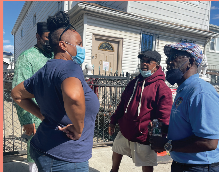
183rd and 184th Streets Hurricane Ida devastation and building back

The record breaking rainfall from Hurricane Ida took us completely by surprise and the devastation it caused our community is still being felt by the homeowners that now live with severely cracked foundations, mold and mildew, and navigating all the city and state agencies that exist to help them.