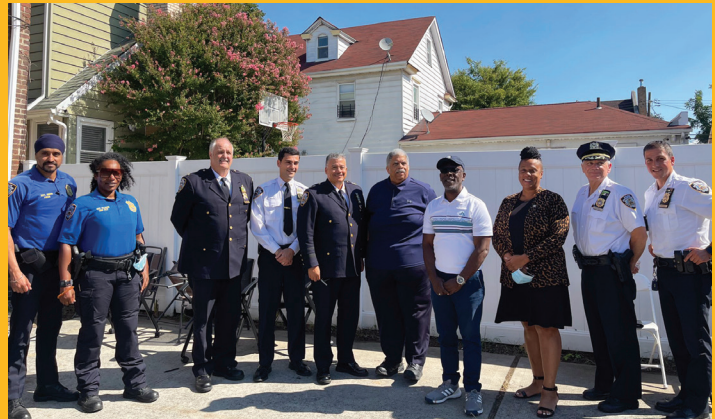
Groundbreaking of the 116th Precinct The groundbreaking of the new NYPD precinct was long awaited

in Rosedale, Queens. This precinct rectifies the decades-long inequality of public protection needed in this area of Southeast Queens. What we need people to understand in this mostly black community is that we need equity and respect from our police. So while I am a supporter of Black Lives Matter I am also a supporter of adequate and respectful policing.