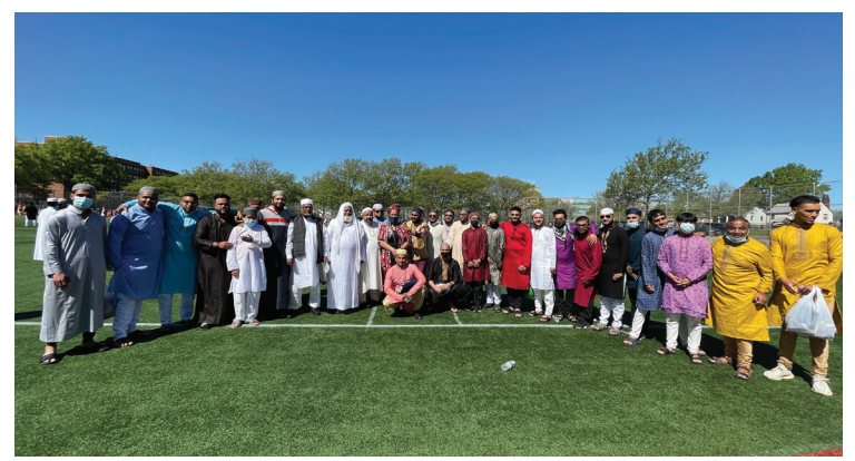
I was honored to join our Islamic brothers and sisters in Queens to celebrate Eid al-Fitr.

I had a great time honoring and celebrating with our seniors during Senior Appreciation Month.