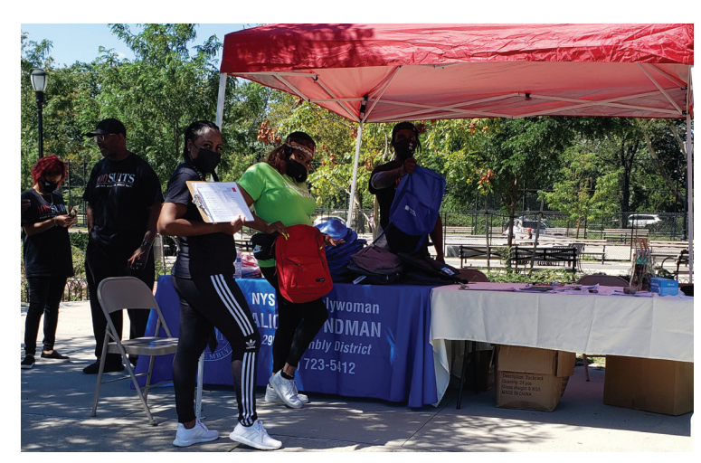
Our Back to School Event with small business owners Teado's and Cheese Bus, and 100 Suits

The record breaking rainfall from Hurricane Ida took us completely by surprise and the devastation it caused our community is still being felt by the homeowners that now live with severely cracked foundations, mold and mildew, and navigating all the city and state agencies that exist to help them.