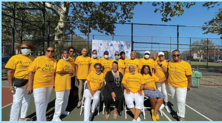
Senior Appreciation Month 2021

I had a great time honoring and celebrating with our seniors during Senior Appreciation Month.