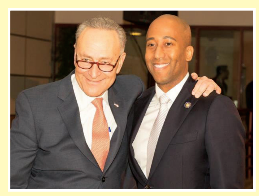
Clyde with Senator Chuck Schumer at Clyde's inauguration ceremony.

While many lawmakers in Washington try to fool Americans into believing this bill will offer millions of dollars in savings, the sad fact is that those savings will only be for millionaires. Their narrow victory represents a tremendous loss for New Yorkers and Americans alike, and we must continue to be outspoken advocates for our healthcare. We must now all call upon the United States Senate to do what is right for Americans and worry less about insurance companies and millionaires. Regardless of the outcome of this atrocious bill in the Senate, the New York State Assembly will continue to fight to protect the care that New Yorkers so desperately need and deserve.