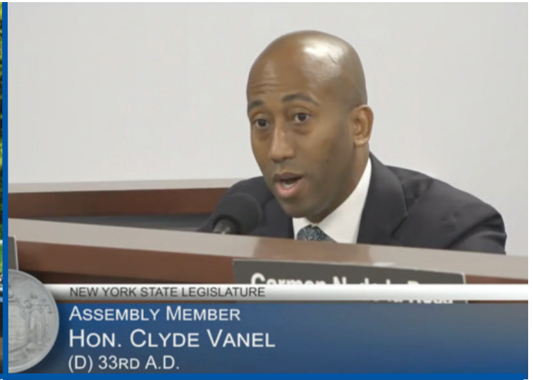
NEW YORK STATE LEGISLATURE ASSEMBLY MEMBER HON. CLYDE VANEL (D) 33RD A.D.