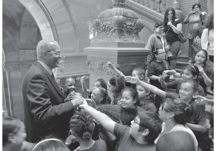
Assemblyman Aubry greets students from P.S. 127Q Aerospace and Science Academy of East Elmhurst on the historic Million Dollar Staircase in New York State's Capitol building in Albany. Ninety teachers, parents, and students converged on Albany to tour the State Capitol and for an educational learning experience in state government with their legislative representative, Assemblyman Aubry.