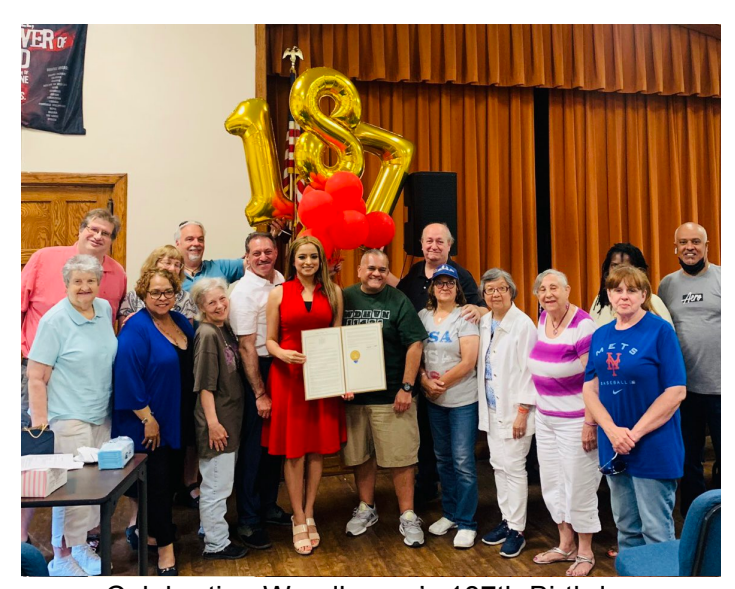
Celebrating Woodhaven's 187th Birthday

Through all the tribulations this extremist Supreme Court has wrought upon us, I promise you I will continue doing everything in my power to protect women's healthcare and prevent gun violence.