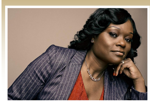
City and State named Assemblymember Rodneyse Bichotte as one of Brooklyn's top 10 elected officials.