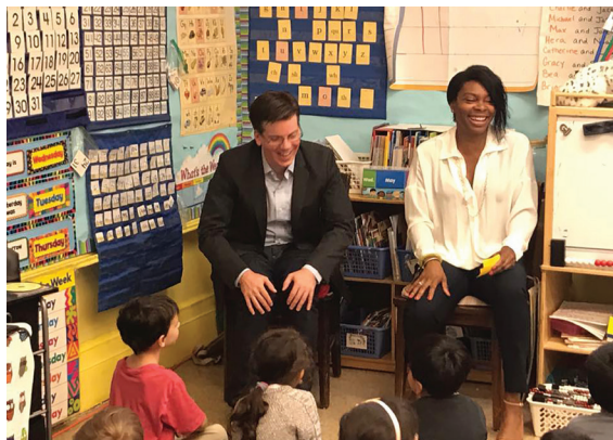
Assemblymember Carroll speaking to a Kindergarten Class at PS 295.

As a result of pressure from the Assembly Majority and School Advocates the Governor dropped his repeal of the Foundation Aid formula and we were able to secure an additional $1.1 billion dollars in Education funding statewide.