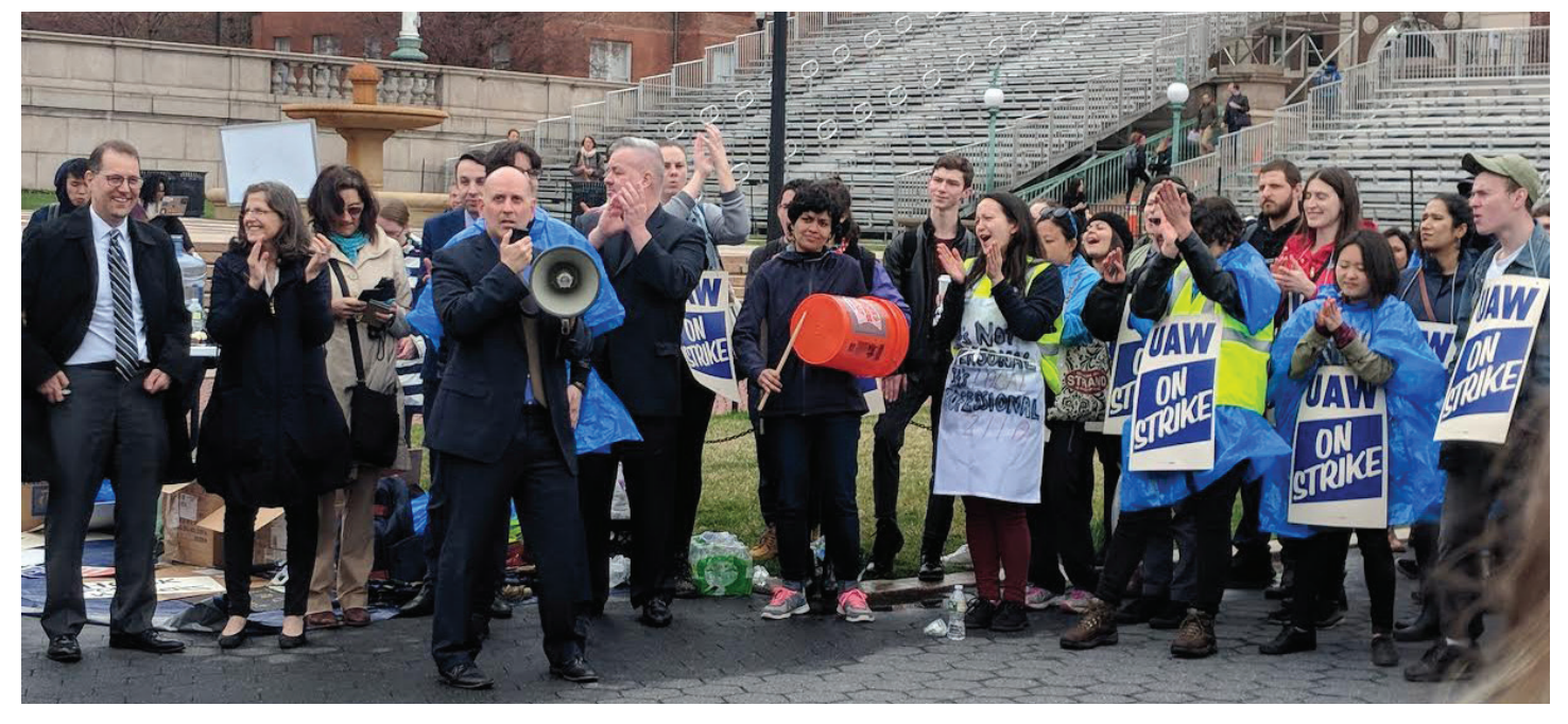
Just days after I was elected, I joined GWC-UAW to urge the administration at Columbia to recognize their union.

Survivors deserve every protection and support our State can afford them. This package represents a big step towards making New York a leader in providing the services survivors need to put their lives back together.