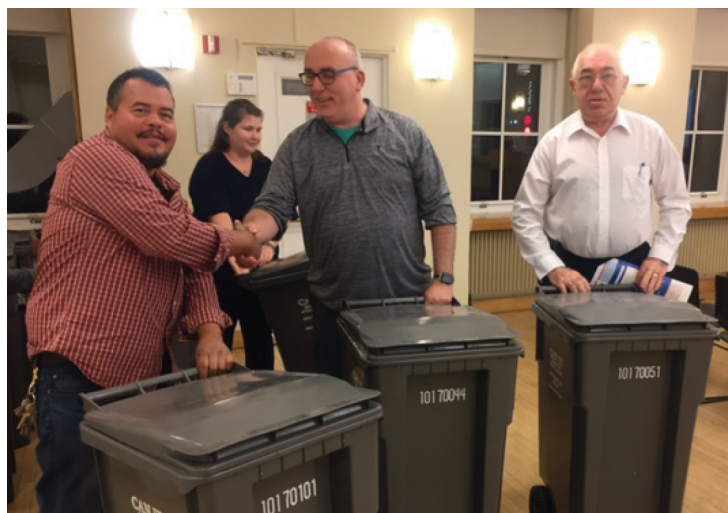
Seawright Hosts Free Rat Academy for the Upper East Side with the New York City Department of Health. Supers and tenants walked away with a free rodent resistant trash can for their property.