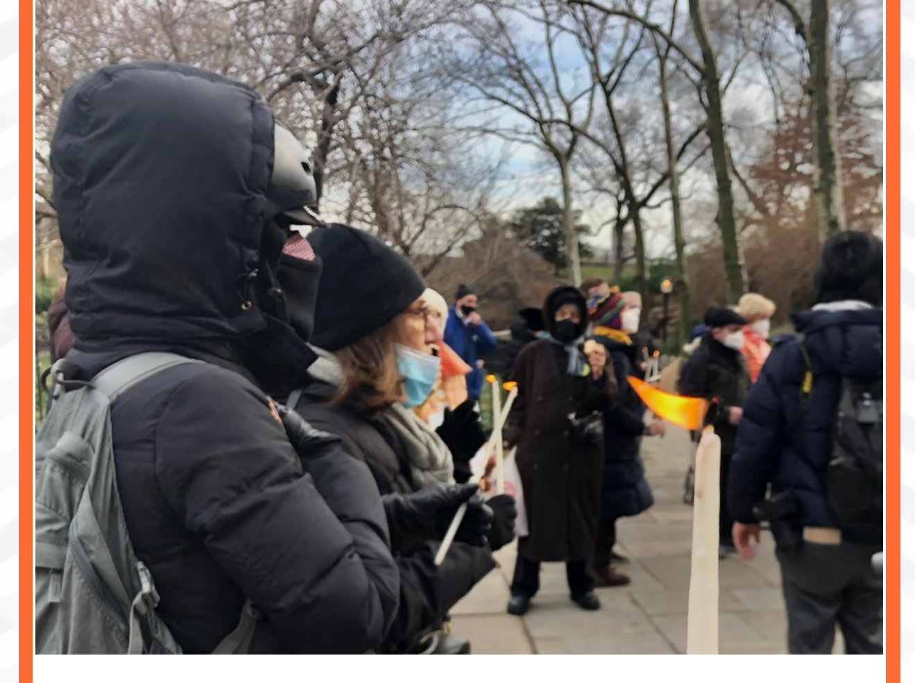
Assembly Member Seawright issued the following statement on January 6, 2022:

"I was horrified to watch an attack on our democratic institutions unfold in Washington on January 6. It was an insurrection led by our former president. His vile actions, rhetoric and the spread of misinformation to the public incited mobs to storm the capitol. It was an act of domestic terrorism and a clear attempt to overthrow a peaceful transition of power. The division grows deeper and the misinformation is proliferating. How each state and locality has handled this pandemic is proof. What happened that day was an outward expression of extremism and division that representatives like Congresswoman Maloney have to fight against in Washington to this day. That is why we can never forget, never lose sight of American values, and never back down in defence of our democracy."