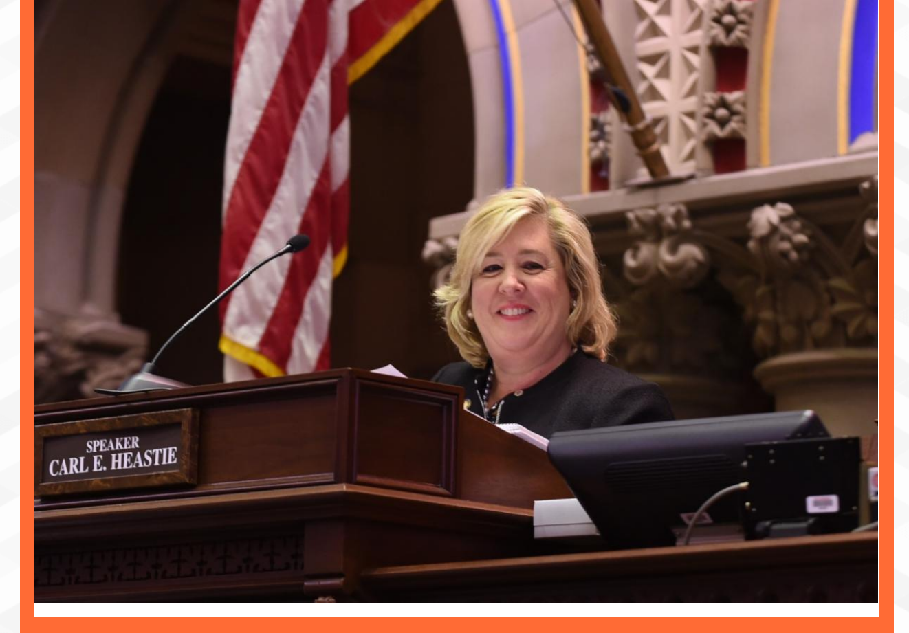
Governor Hochul Delivers 2022 State of the State Address