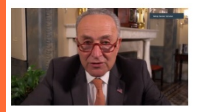
Charles E. Schumer, U.S. Senate Majority Leader