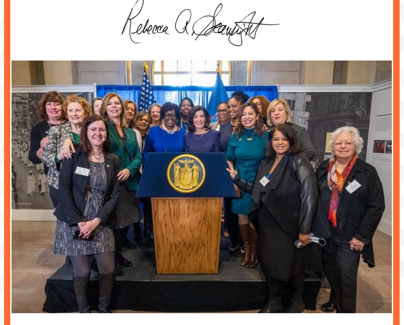
The women of the Assembly Majority, Majority Leader Crystal Peoples-Stokes, and Governor Hochul on International Women's Day, March 8, 2022.