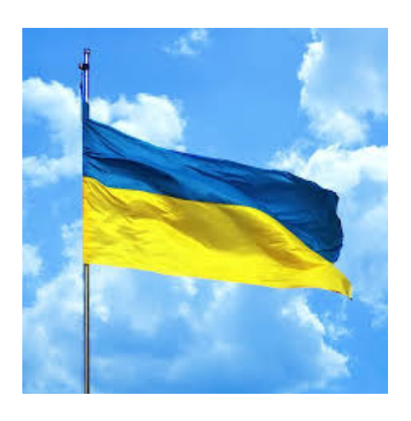
<u>CIDI - Ukraine Crisis</u> International Red Cross