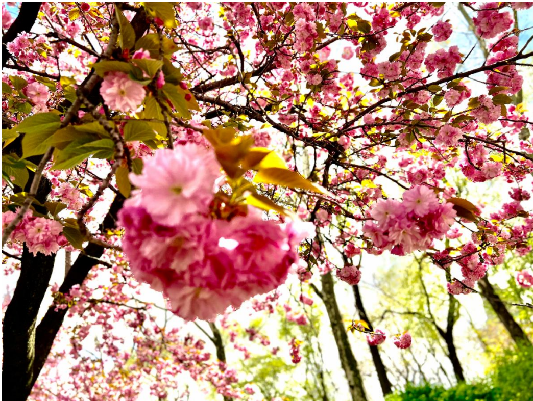
Cherry blossoms in bloom.