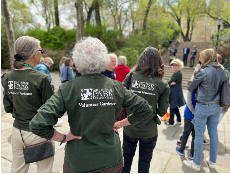
Hardworking Carl Schurz Park volunteers organized a self-guided exhibit through the park.