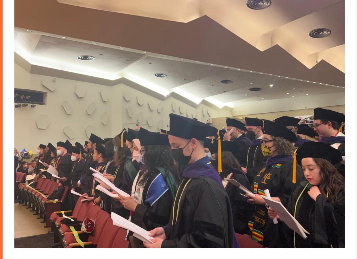
The graduates reciting "The Lawyer's Pledge."