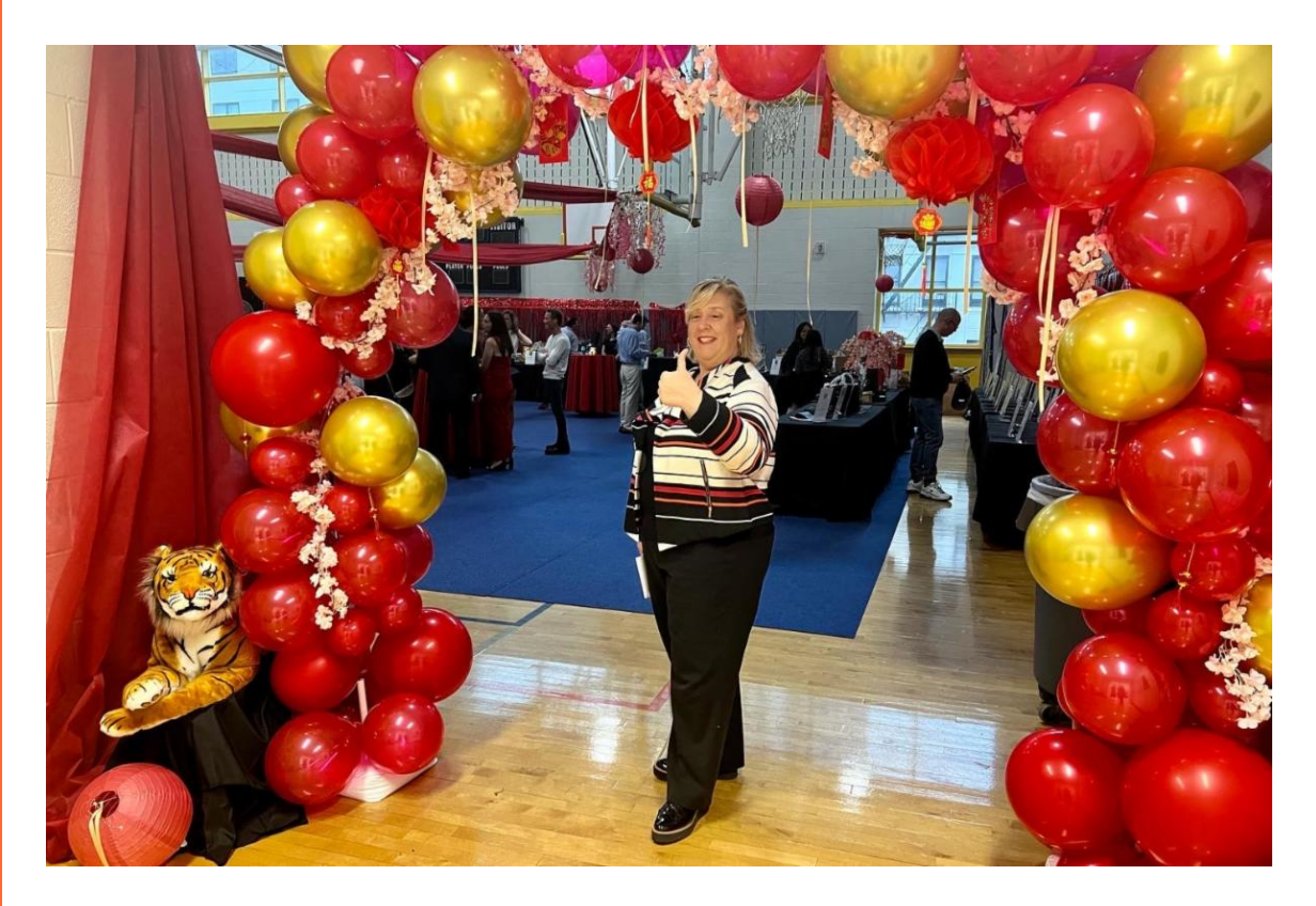
It was the Year of The Tiger at the East Side Middle School Auction.