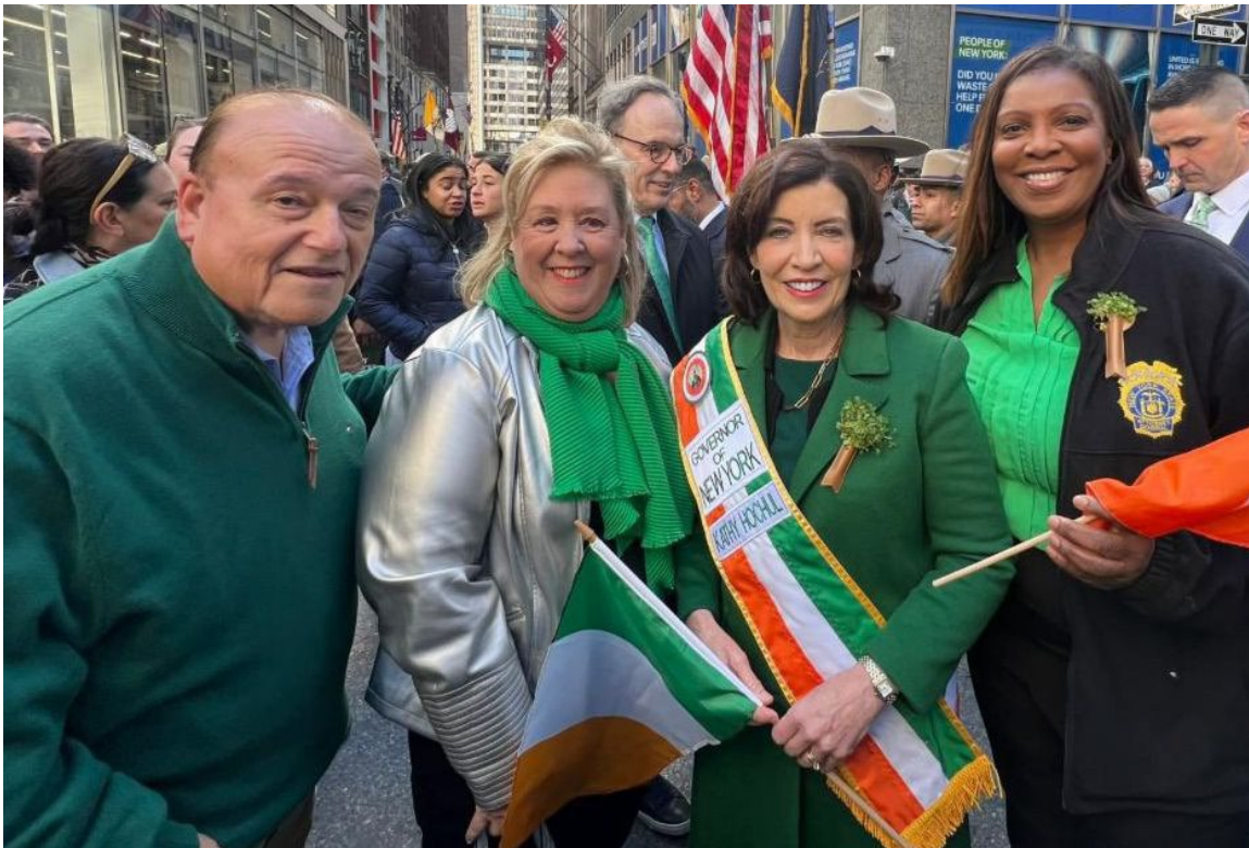
On Saturday the parade kicked off on Fifth Avenue in celebration of Irish culture.