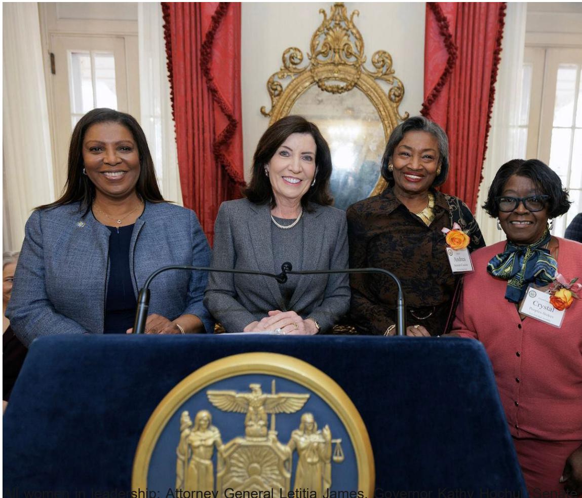
Women in leadership: Attorney General Letitia James, Governor Kathy Hochul, Senate Majority Leader Andrea Stewart Cousins, and Assembly Majority Leader Crystal Peoples-Stokes.