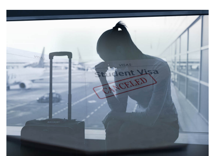
Trump Administration cancels visas, threatening the futures of NY students

A new state law (Ch. 544 of 2024) allows schools to use existing grants to fund anti-gun violence education programs. By allowing schools further access to the resources they need, we can help ensure that students feel safe and secure in their learning environments.