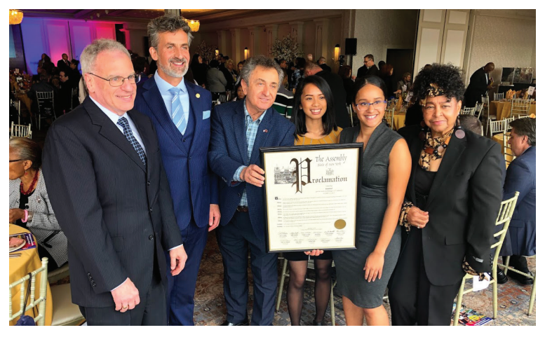
25 YEARS OF BRONXNET: One of the finest media organizations in New York City, BronxNet has been a staple of public television for a quarter of a century. It was wonderful to join them for their celebration of 25 years, and I look forward to many, many more!

If your apartment is not meeting these requirements, please report the condition to the New York City Department of Housing Preservation and Development by calling 311 or submitting a complaint online. HPD should then send an inspector to your apartment to verify the condition and, if verified, a violation will be sent to your landlord. My office is available to help follow up on these 311 complaints with HPD if you are having difficulty getting HPD to send an inspector to your apartment or to help remind your landlord of the heating and hot water requirements. It may be helpful for you to maintain a log of your apartment temperatures to more easily demonstrate the problem. Rent regulated tenants may also be eligible to apply for a rent reduction based on decreased services through New York State Homes and Community Renewal.