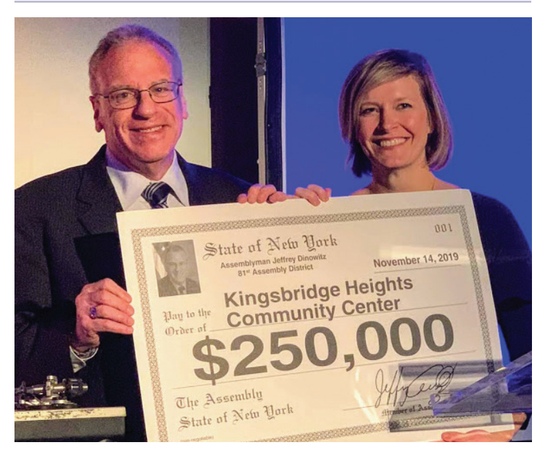
SUPPORTING KINGSBRIDGE HEIGHTS COMMUNITY CENTER: I am excited to dedicate $250,000 to Kingsbridge Heights Community Center to help provide capital improvements which will rehabilitate their building. This community center is a wonderful resource for the surrounding neighborhoods, offering programs for children and teens as well as meeting space for community organizations.

These are changes that should ultimately happen at the city level, but I will continue to advocate for reforms and stand up for the community when a development is being proposed that is out of scale with what our neighborhoods need.