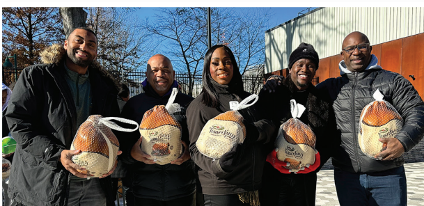
Senator Bailey, Assemblyman Heastie, Bronx Borough President Gibson, Councilman Riley, Congressman Bowman pictured at the Annual Thanksgiving Turkey Distribution.

Council of Carpenters and the Food Industry Alliance provided turkey dinners for families in the Northeast Bronx for Thanksgiving celebrations.