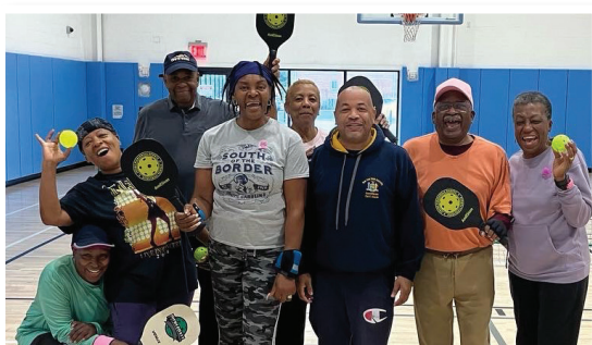
Speaker Heastie pictured with community members at the YMCA pickleball courts.

The Northeast Bronx YMCA has become a staple in the community, bringing families and friends together through programs/activities that focus on healthy living. Pickleball, a game known for its inclusion of all, is one example of the fun that can be had at the YMCA. Speaker Heastie is a frequent visitor of the pickleball courts. With over three thousand members, the Northeast Bronx YMCA is here to stay for generations to come.