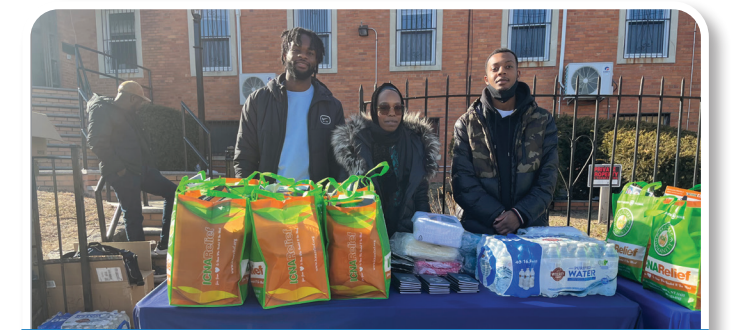
#TeamHeastie distributing food at a Community Event