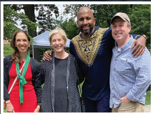
Pelham Picture House's Juneteenth celebration.