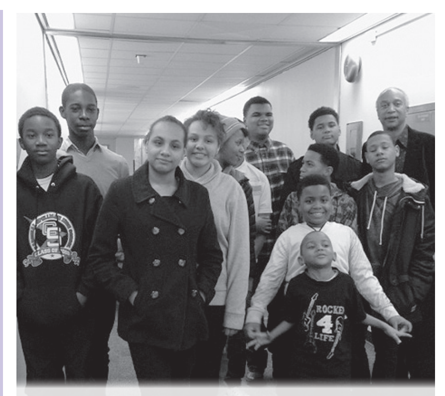
"When it comes to our schools, students have to be our top priority, and we must do everything we can to ensure they are getting the quality education they rightfully deserve."

The renovations of both projects are certainly worthwhile and a big step towards improving the quality of life for people who live, work and play in the community. Both have been out of service for many years, and I am happy to assist in allowing them to once again become important gathering places for students, athletes and local residents.