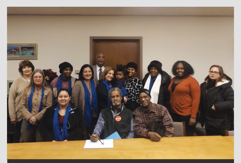
Neighborhood Preservation Coalition of NYS