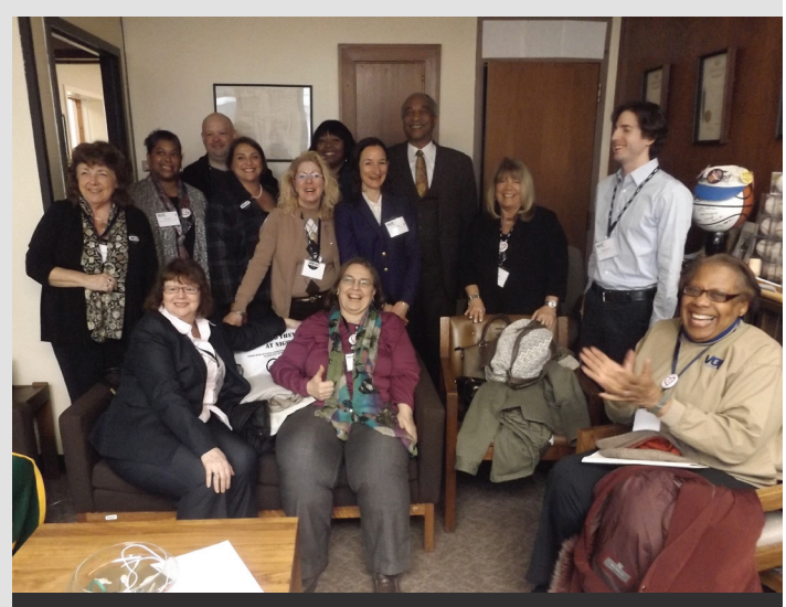
New York United Teachers