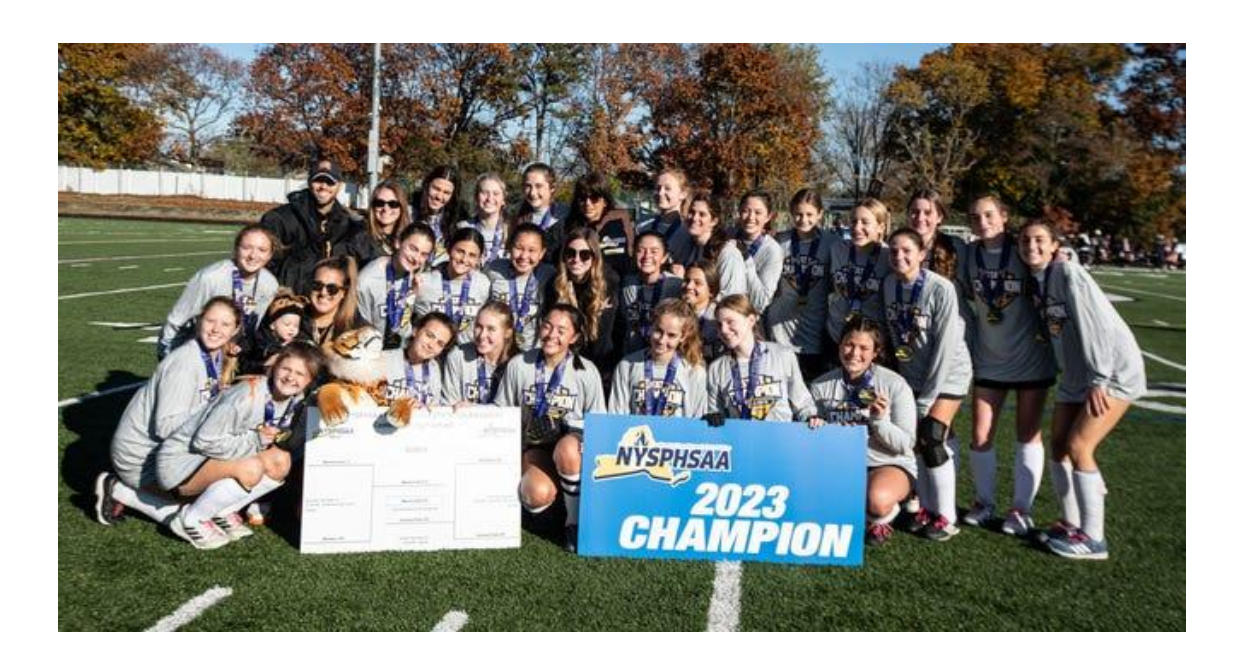
Rye High School Girls Varsity Soccer Team Class A State Championship Title won on November 12<sup>th</sup>