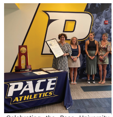
Celebrating the Pace University Women's Lacrosse Team, 2023 NCAA Division II champions — a Westchester County university's first national team title!