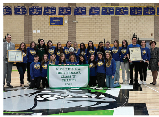
Celebrating the Irvington Girls Soccer team, New York State 2022 Class B champions