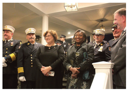
At the Elmsford Fire Department inspection