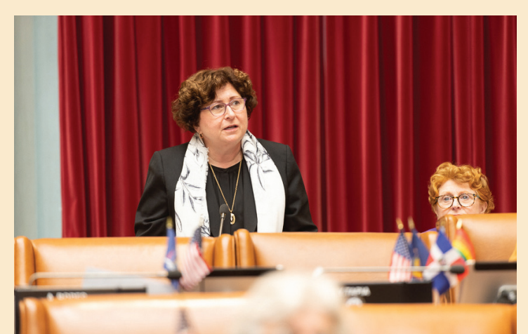
In session at the New York State Assembly Chambers in Albany

River Parkway and other County thoroughfares (A.7206B)