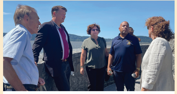
Inspecting the Tarrytown waterfront with Assembly Speaker Carl Heastie