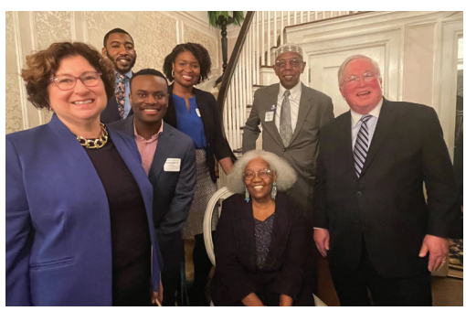
Celebrating Black History Month at Mercy University in Dobbs Ferry