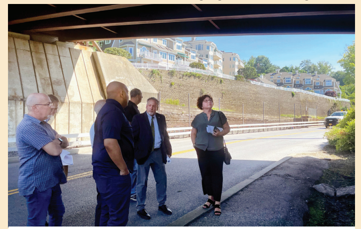
Viewing deterioration under the High Street Bridge in Dobbs Ferry

It was my great pleasure to host Assembly Speaker Carl Heastie on a tour of District 92 this August, where he announced investments in critical local infrastructure projects. $2 million will be used to repair the High Street Bridge in Dobbs Ferry. $500,000 will help fund repairs to the H-Bridge in Tarrytown, and an additional $100,000 will help fund an initiative for electric vehicle charging stations Irvington.