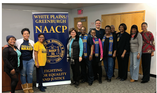
With the NAACP White Plains/Greenburgh chapter for their screening of Selma