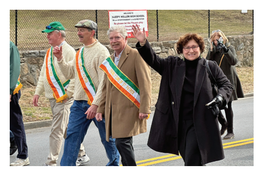
Marching in the Sleepy Hollow St. Patrick's Day Parade