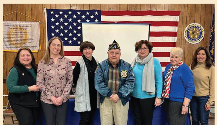
Commemorating the Four Chaplain Heroes of World War II at Valhalla American Legion Post 1038