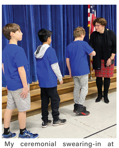
My ceremonial swearing-in at Springhurst Elementary School, Dobbs Ferry