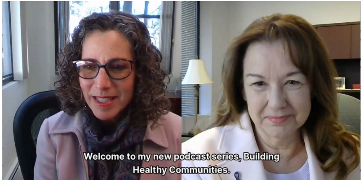
A screenshot from the first episode of my new podcast series, Building Healthy Communities .