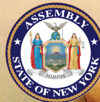
ASSEMBLYMAN BRIAN MAHER 101 ST ASSEMBLY DISTRICT

A background image showing a quill pen and an inkwell resting on a parchment document. The parchment has the words "We the People" written in cursive, along with other faint text and a circular stamp.