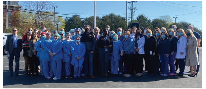
Celebrating National Donate Life Month in April with the dedicated medical professionals at Montefiore St. Luke's Cornwall Hospital in Newburgh.

The Supreme Court has once again shown it is out of touch with the majority of Americans in its decision overturning Roe v. Wade , a nearly 50-year precedent which provided Constitutional protections for the right to an abortion.