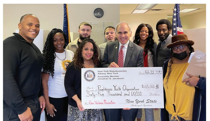
Announcing a grant to Poughkeepsie Youth Organizations as part of the Gun Violence Prevention Program.

I will continue to fight to ensure that reproductive freedom and the ability of women to make their own health care decisions are preserved in New York.