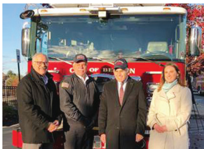
Announcing the new firetruck with Beacon City officials. I secured a grant which helped pay for the truck.