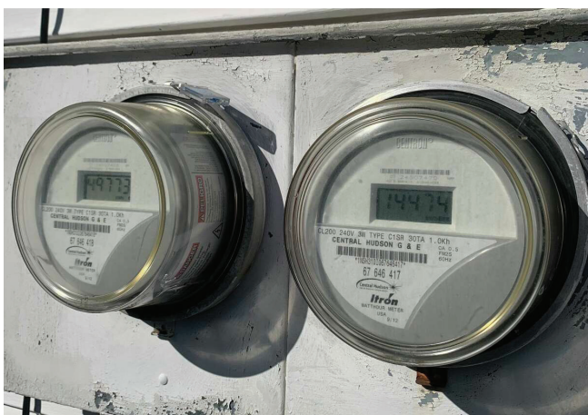
Your electric bill should be timely and not be a mystery.

I won't stop fighting until Central Hudson gets its billing act together.