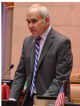
Addressing the Assembly in Albany

I'm also working hard to protect taxpayers and help save their hard-earned money. I passed a major Industrial Development Agency (IDA) reform bill that will prevent corruption and conflicts of interest in our local IDAs. Further, since the beginning of this year, my office has been handling