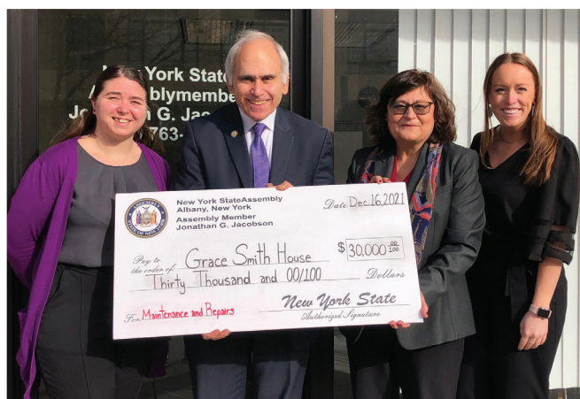
Presenting a grant to Grace Smith House in Poughkeepsie. Grace Smith House protects women and their children from domestic violence and abuse.