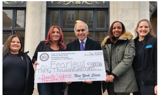
Presenting a grant to Fearless! (formerly known as Safe Homes) to assist with their efforts battling domestic violence.

But a prohibition without a penalty is not a deterrent. Thanks to my bill, any person violating these restrictions will be subject to a civil penalty of five times the compensation or benefit received by the person.