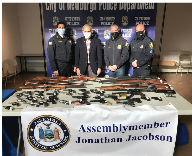
After a successful gun buyback in the City of Newburgh.