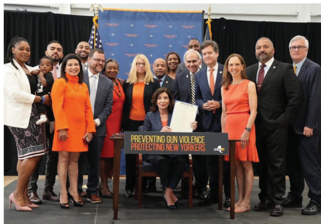
With Governor Kathy Hochul signing our package of commonsense gun safety laws in June including my bill to limit those who can purchase body armor.

The battle against gun violence is never ending. We must continue to be vigilant.