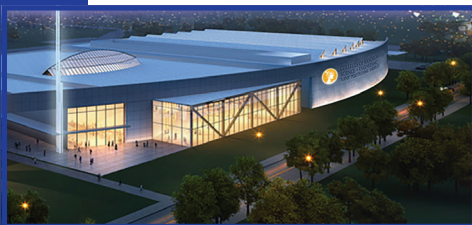
A rendering of the new Athenex pharmaceutical facility under construction in Dunkirk

Castelli America, Inc. , an Italian cheese processor, invested several million dollars to purchase Empire Specialty Cheese, a manufacturing plant in Chautauqua County, and acquire new machinery and equipment for the facility. New York provided a $500,000 capital grant and a $5.5 million loan. The company now employs over 70 people.