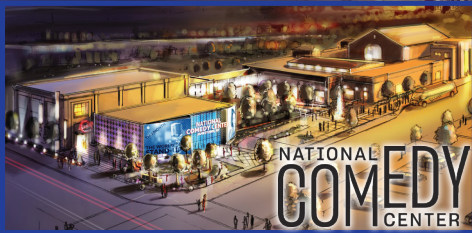
A rendering of the National Comedy Center

Here are just a few of the projects taking place right here in Chautauqua County: