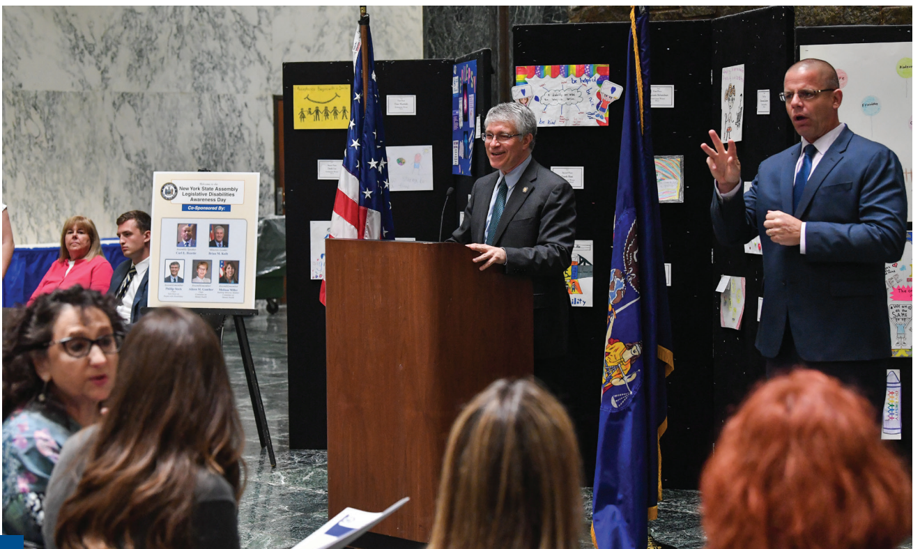
Assembly Member Phillip Steck addresses the crowd gathered in the Well of the Legislative Office Building for the first time as Chair of the Assembly Task Force on People with Disabilities.